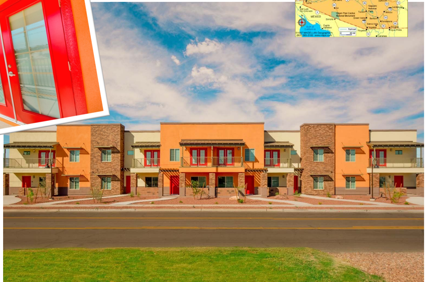
Mesa Heights – 58 Units Yuma, AZ