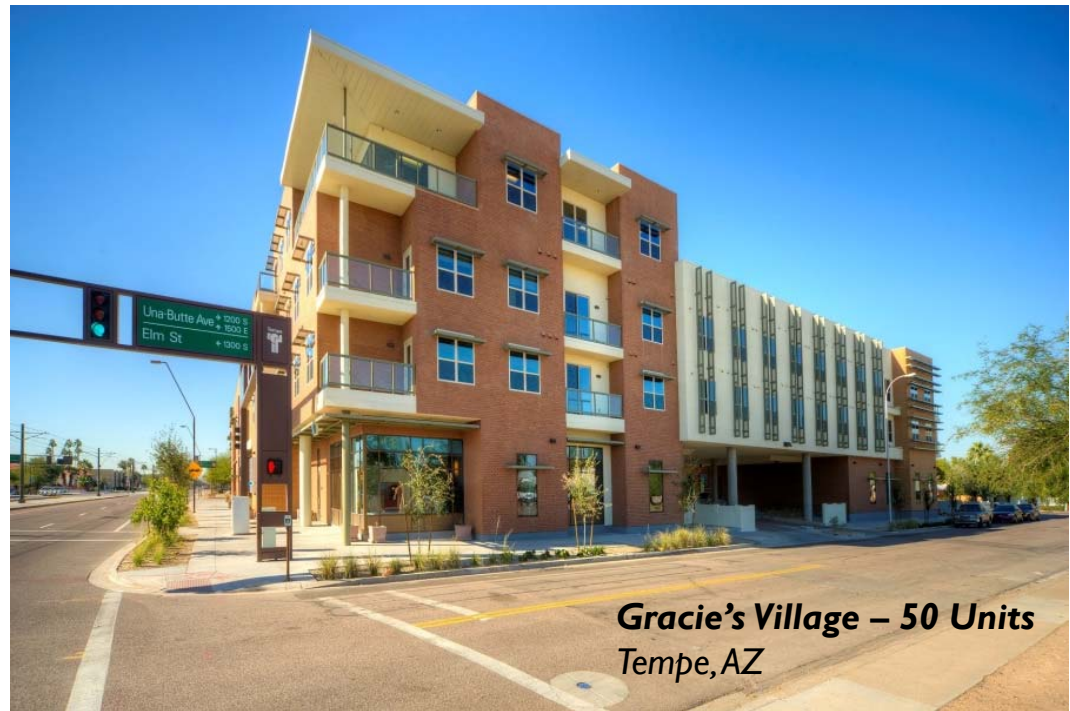
Gracie's Village – 50 Units Tempe, AZ