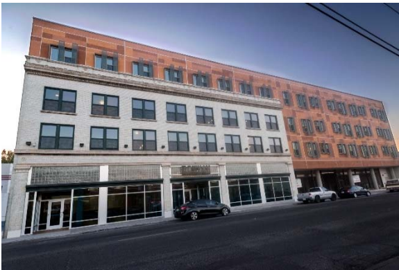
Bowman Senior Residences – 48 Units Nogales, AZ