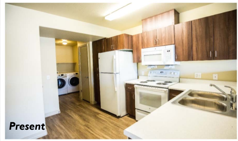
Coffelt Homes – 301 Units Phoenix, AZ