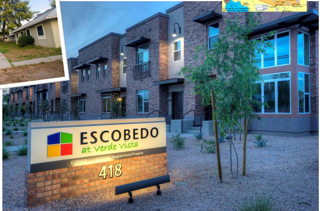
Escobedo at Verde Vista – 70 Units Mesa, AZ