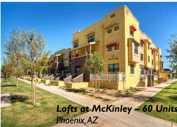
Lofts at McKinley – 60 Units Phoenix, AZ